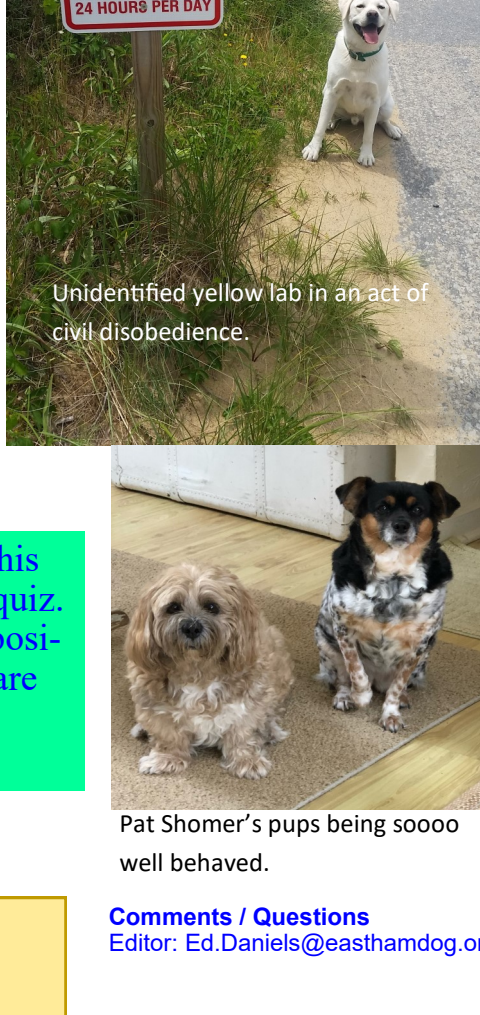
Unidentified yellow lab in an act of civil disobedience.

P.S. I'm so happy they did not put up that obnoxious sign this year.