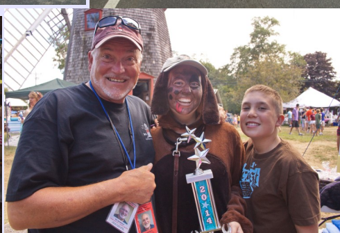
Best Float Award two years running.

JOIN YOUR EASTHAM DOG OWNERS IN THE PARADE. It's a HOOT.